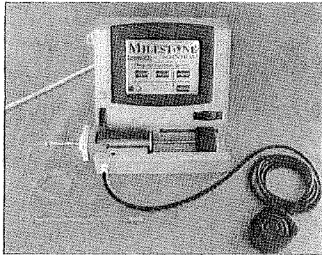
Fig 1 CompuFlo, a fluid-pressure computer-controlled local anesthetic delivery system.

Syringe-based drug delivery systems have evolved out of the need to economically and conveniently store and deliver drugs. Since the 1940s, the glass anesthetic cartridge has served as a practical means to providing a premixed drug to be used in conjunction with a metallic, breech-loading, aspirating syringe. 1,2 A traditional dental syringe can be more appropriately referred to as a hand-driven dental syringe . It is not ergonomically designed to allow precise manual control of fluid flow, nor does it allow hydrodynamic elements of the system to be altered. To address these deficiencies, an innovative dental device for the administration of local anesthetic was developed by Spinello. 3 In 1997, after modifications to the original design were made, it became commercially available from Milestone Scientific as the Wand. 4 It has since been renamed the CompuDent/Wand System from Milestone Scientific. 5 In 2001 an additional device named Comfort Control Syringe (CCS) was introduced by Dentply International into the dental market. 6 These computer-controlled local anesthetic delivery systems (CCLADS) represent a dramatic shift in administration by enabling the precise control of a flow rate during all dental injections.